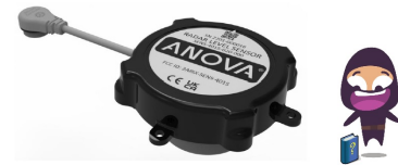
ANOVA SENS-4015 Radar Level Sensor