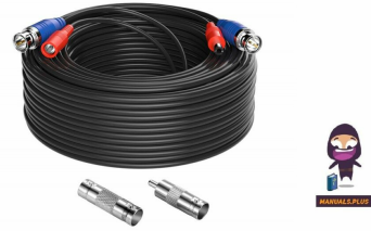
Anlapus ASP-3004B1-B BNC Video/Power Extension Cables