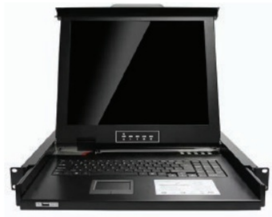
AL-V516P FRONT VIEW

In addition, the AL-V516P included an additional hot-pluggable USB port that supports other keyboard and mouse for back-up. With all of the technology involved, the AL-V516P LCD KVM Console has gone beyond the expectations and requirements for a modern Data Center use, which including : short space optimization, exceptional display quality, easy to install, extreme versatility.