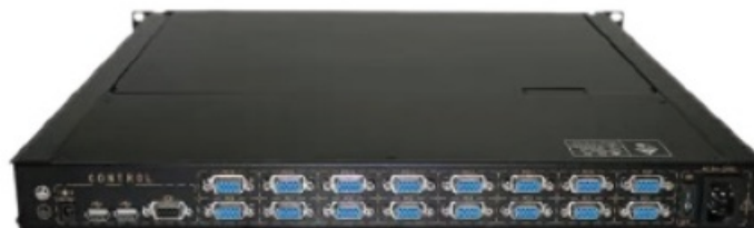
AL-V516P REAR VIEW