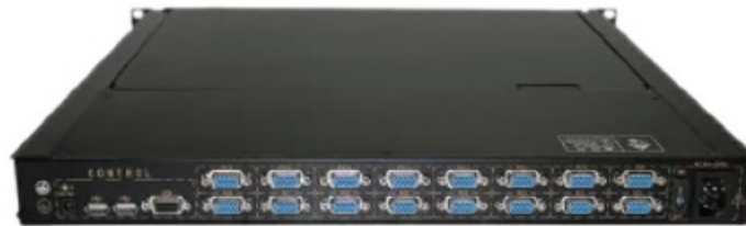
AL-V508P REAR VIEW