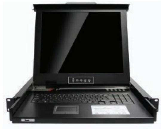
AL-V516P FRONT VIEW