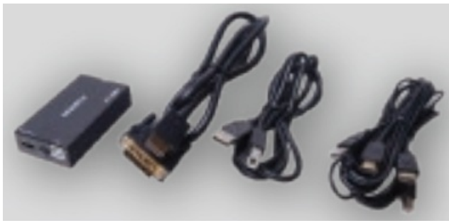
SHORT DEPTH RACK KVM SWITCH AR-V16L