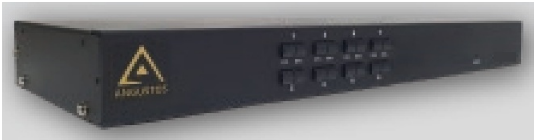
16 PORT HDMI 4K KVM SWITCH AR-H16L