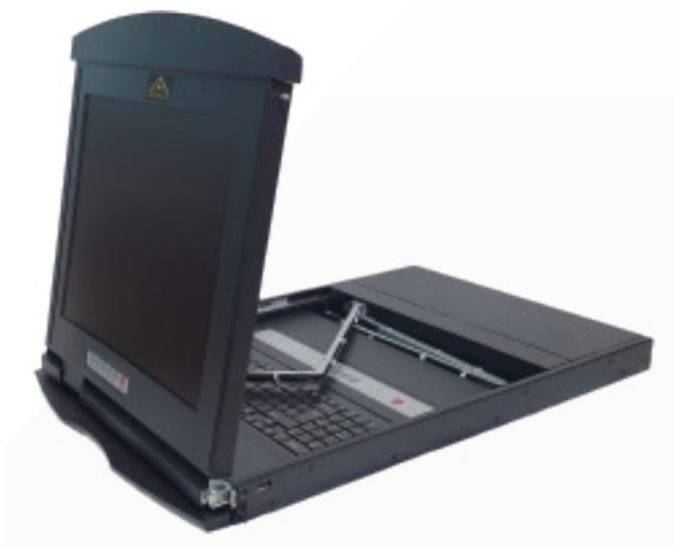
AL-DV700L FRONT VIEW

In addition, the AL-DV700L included an additional hot-pluggable USB port that supports other keyboard and mouse for back-up. With all of the technology involved, the AL-DV700L LCD KVM Console has gone beyond the expectations and requirements for a modern Data Center use, which including : short space optimization, exceptional display quality, easy to install, extreme versatility