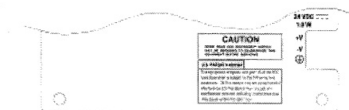
Optional DC Power Layout