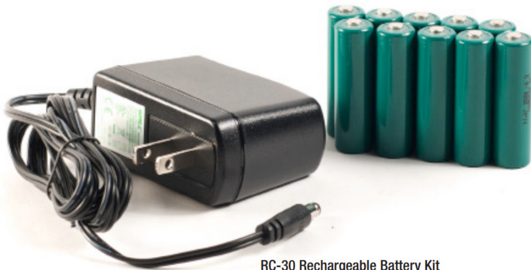
RC-30 Rechargeable Battery Kit