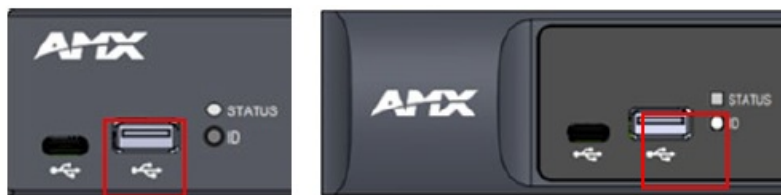
FIG. 10 USB Type A host port on MU-1300 (Left) and MU-2300 & MU-3300 (Right)