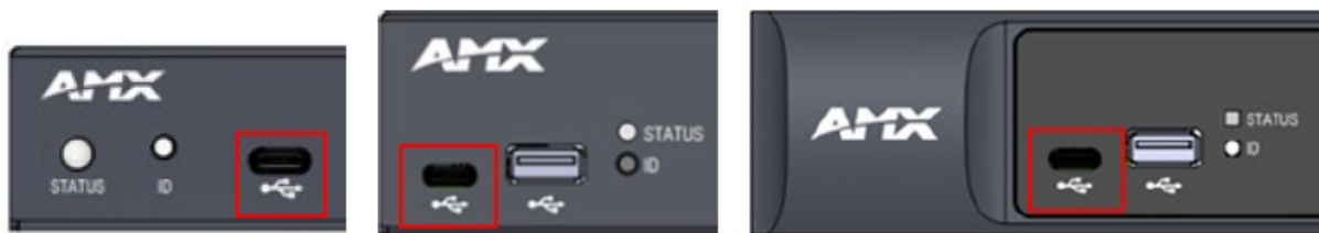
FIG. 9 USB-C Program port On MU-1000 (Left), MU-1300 (Center), and MU-2300/3300 (Right)