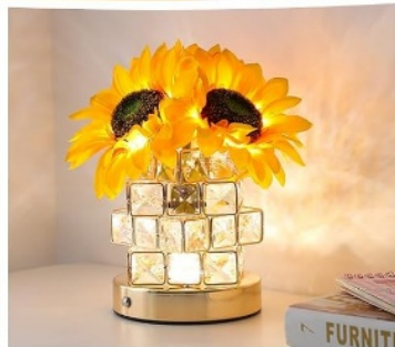
• Natural light •