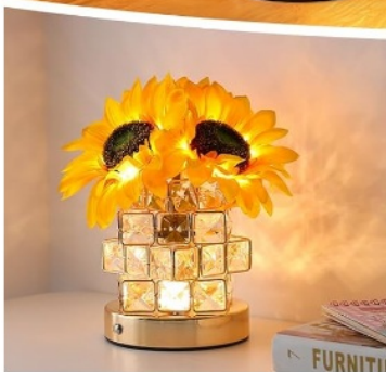
• Warm light •