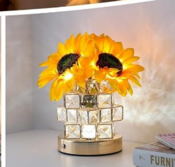
• White light •