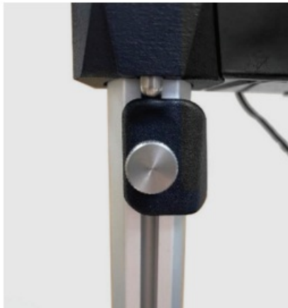
Fig.02: Silver Button