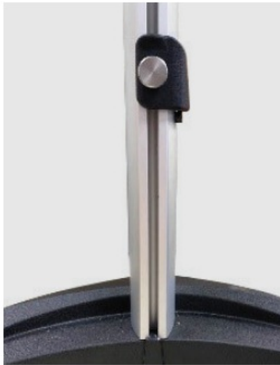
Fig.01: Lower Mechanical Stop