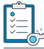
Dedicated Business Coach