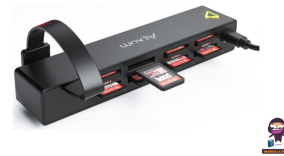
Alxum D1100C Switch Game Card Reader