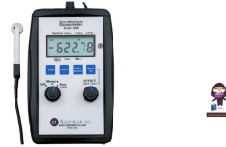
ALPHALAB INC VGM Vector Magnitude Gaussmeter