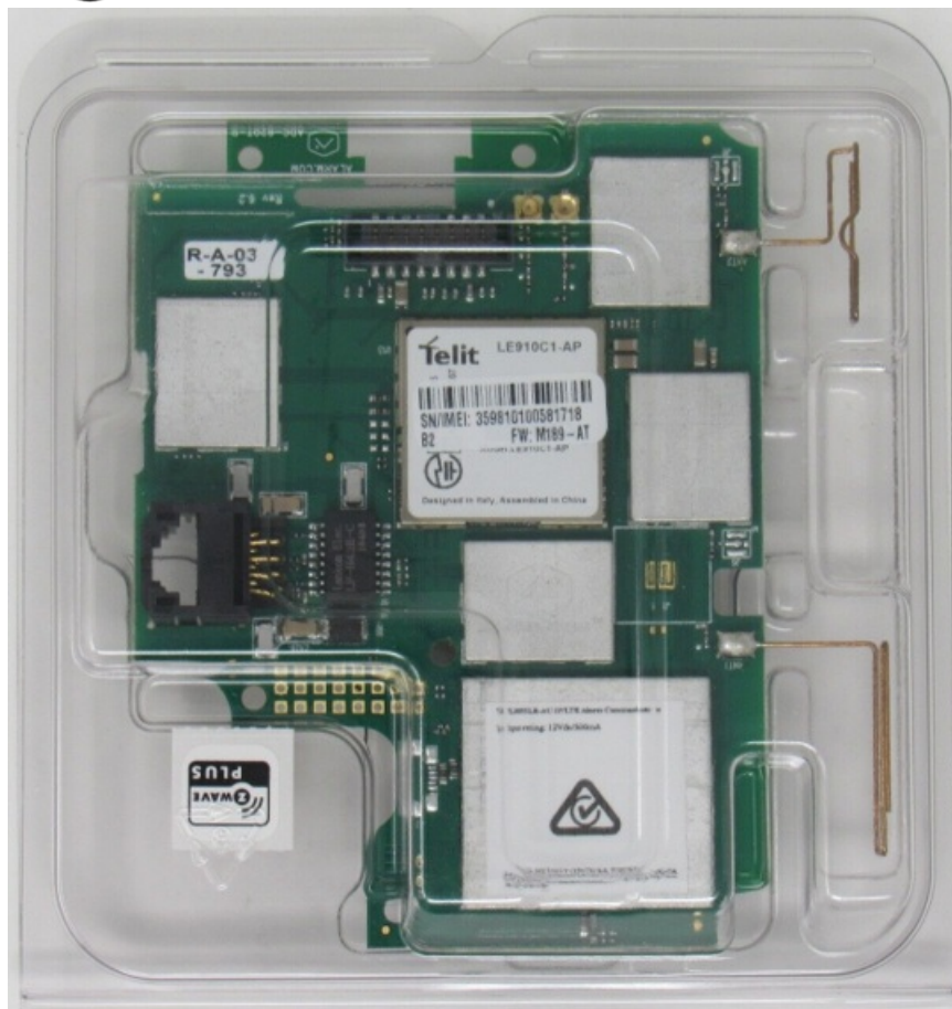
ADC-630T Module INSTALLATION GUIDE