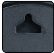
Easy To Hang