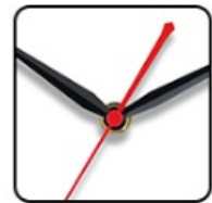
Quality Metal Hands