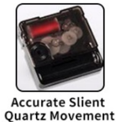
Accurate Slient Quartz Movement