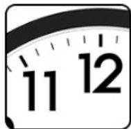
Clean Minutes Marks