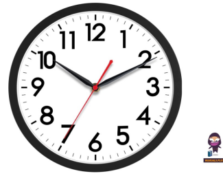
AKCISOT 116 WALL CLOCK