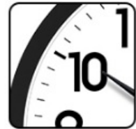
Large Bold Numbers