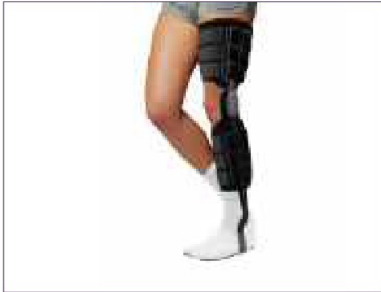
8.23. Knee and hip orthosis with rom adjustment OKD-14 , REF AVL_216 The orthotics stabilizes the hip and knee joint in the frontal and sagittal plane.