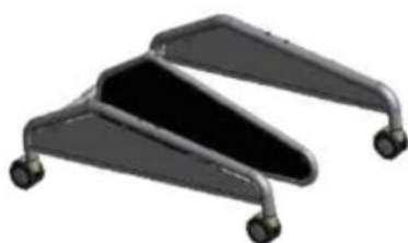
3) Frame with lower limbs separator