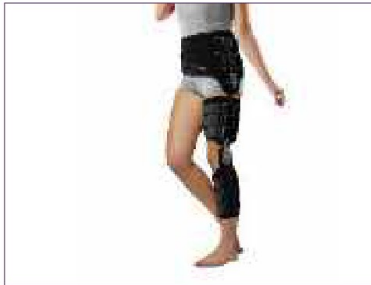
8.24. The lower limb brace OKD-13, REF AVL_217 It allows for safe and independent movement of the patient e.g. from wheelchair to bed.