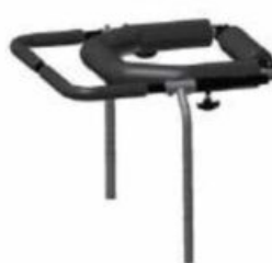
2) Pelvic brace