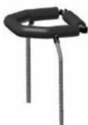
1) Chest brace