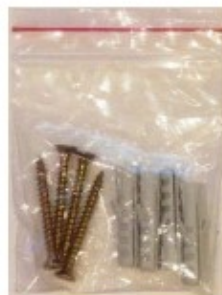
4 x SCREWS AND WALL PLUGS FOR WALL MOUNTING