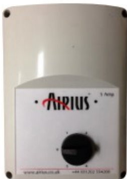
SPEED CONTROLLER (FULLY ASSEMBLED)