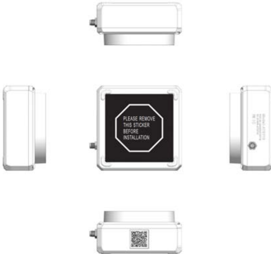
Figure 1. AGN3 device

The AGN3 is a solar-powered tank sensor monitoring device.