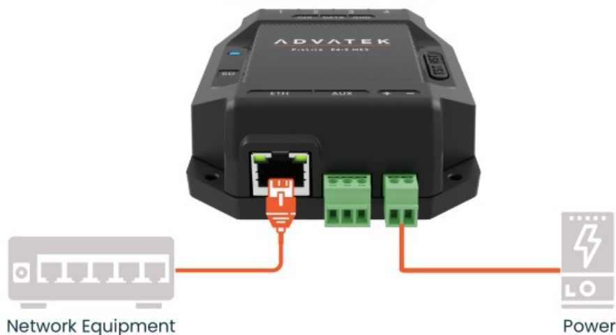
Figure 1: Connection Points

In order to connect to the PixLite E4-S Mk3, there must be a working power supply between 5 – 24Vdc connected to the power input, which is the small screw terminal marked “+” & “-”. The screws should be loosened for wire insertion and then tightened again, providing a highly robust and secure connection. Polarity for the connector is clearly marked on the lid.