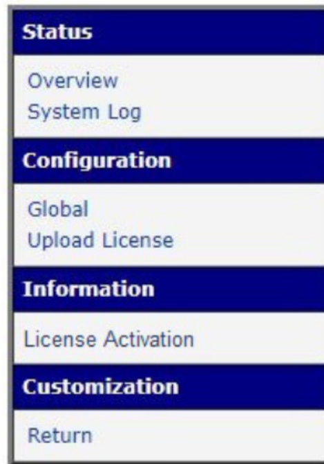
Figure 1: Menu