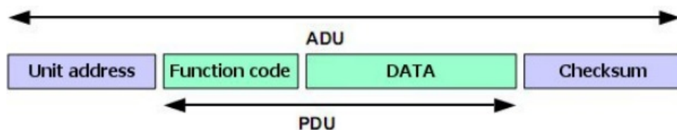
Figure 2: Modbus message on serial line

When sending a PDU to the serial line, the address of destination unit obtained from a MBAP header as UNIT ID is added to the PDU along with the checksum.