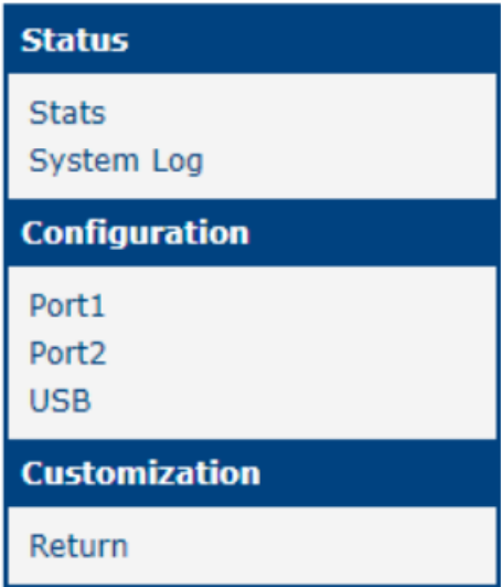
Figure 3: Menu

Web interface is accessible by pressing the module name on the Router apps page of the router Web interface. The left part menu of the Web interface contains these sections: Status, Configuration and Customiza-tion. Status section contains Stats which shows statistical information and System Log which shows the same log as in the router’s interface. Configuration section contains Port 1, Port 2 and USB items and Customization contains only menu section switches back from the module’s web page to the router’s web configuration pages. The main menu of module’s GUI is shown on Figure 1.