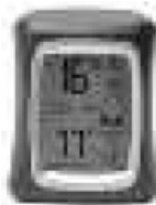
Temperature & Humidity