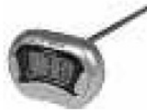
Kitchen Thermometers & Timers