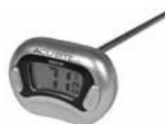
Kitchen Thermometers & Timers