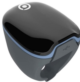
Figure 1: PPG 100 sensor

This product is intended to be used for measuring, displaying and storing adults' pulse oxygen saturation (SpO 2 ), pulse rate of adults in home or healthcare facilities environment.