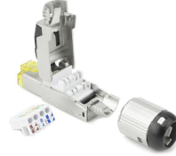
ACT TD168F Field Termination Plug