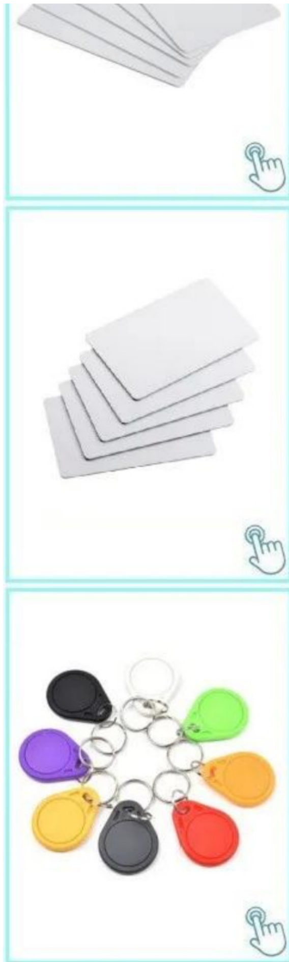
ACM-EMI-S RFID card 125Khz EM Proximity Card Size 86*54mm ACM-MF1 RFID Card MF1 Compatible Card.