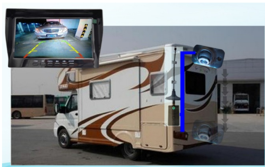
Camera up or down