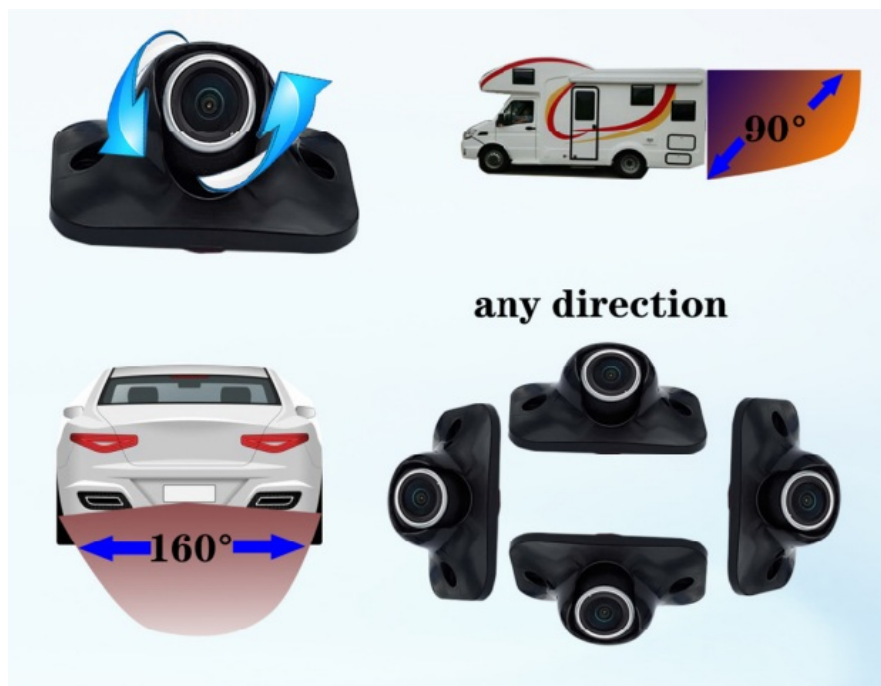
Camper van install