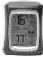
Temperature & Humidity