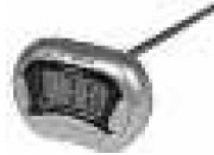
Kitchen Thermometers & Timers