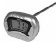
Kitchen Thermometers & Timers