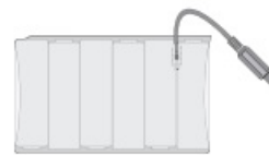
3 Temporary Battery Pack