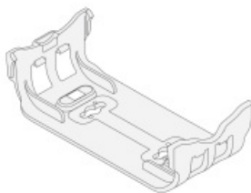
6 Mounting Bracket