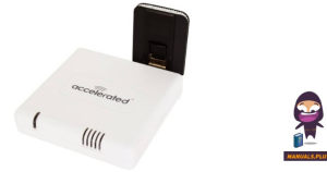
accelerated 6300-LX USB Router