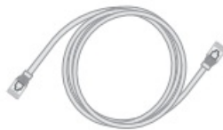
4 Ethernet Cable