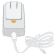
2 Power Supply Unit