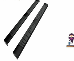
PZ C-3029 Running Boards