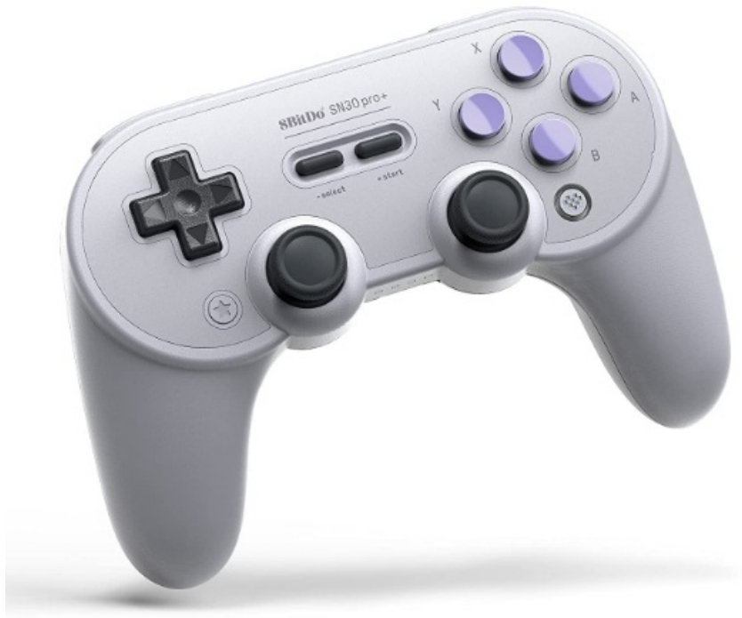
SN30 Pro+ Bluetooth Gamepad